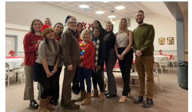
EmPoWER staff at the 10th Annual Veteran Appreciation Dinner, hosted for Veterans at Valley Brook Village and Community Hope, Sponsored by NJPN and Stirling Elks Lodge,