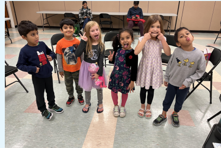
Kindergarteners having a blast at Happy, Healthy Me!