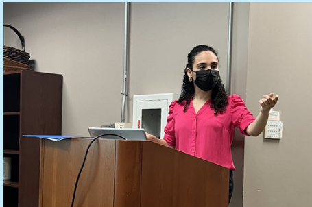
Facilitating Teen Speak Workshop