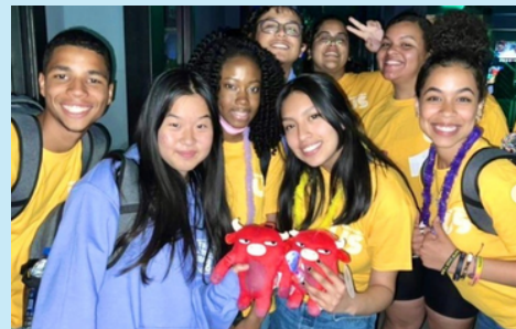
EmPoWER Youth Advisory Board at IPlay America