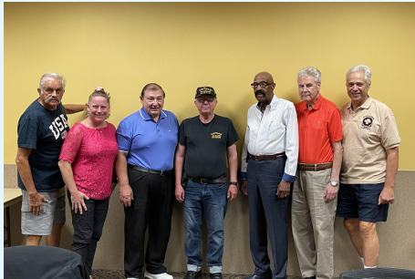
Veterans at the Wellness Initiative for Senior Education (WISE for Veterans)