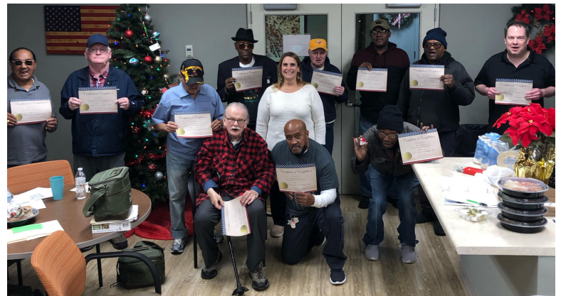
EmPoWER facilitated Achieving Personal Balance programs for Veterans in our community.