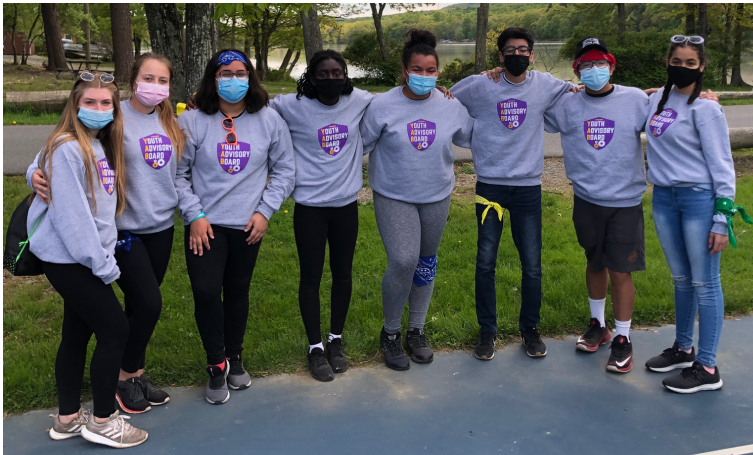
EmPoWER Youth Advisory Board members spent the day at Youth Leadership Camp at the Fairview Lake YMCA.