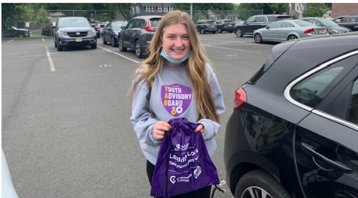
EmPoWER partnered with Community in Crisis on the Lead With Love pay-it-forward campaign for teens who may be dealing with a difficult time. The bags were filled with treats, personal care items, and resources for mental health support.