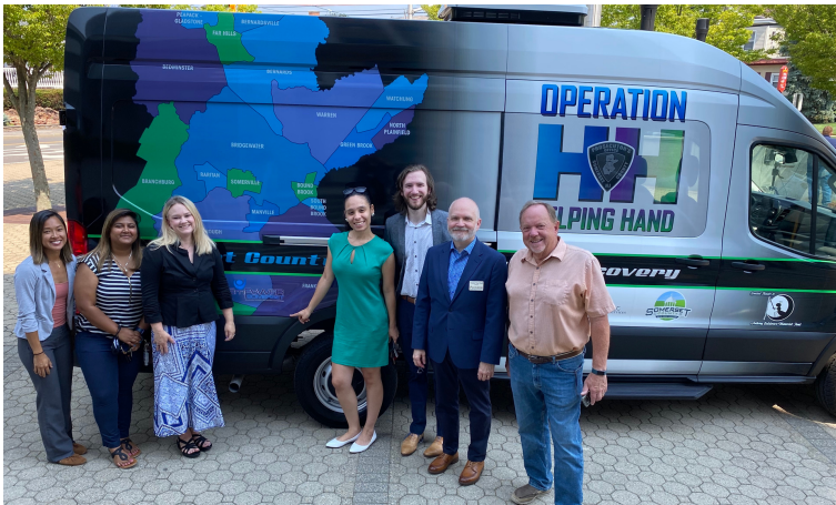
EmPoWER is a proud partner in Operation Helping Hand, an initiative led by the Somerset County Prosecutor's Office to assist individuals struggling with substance abuse and dependence by providing resources and support through community and door-to-door outreach.