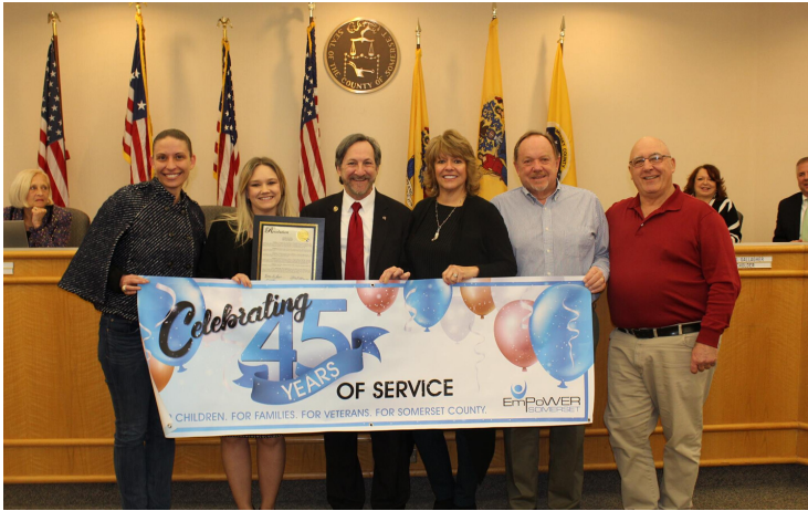
Empower Somerset was honored to receive a Resolution from the our Somerset County Board of Chosen Freeholders commemorating the organization's 45 years of service to the community.