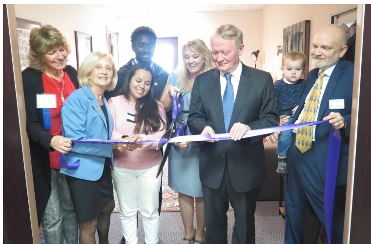
EmPoWER Somerset and Pioneer Family Success Center ribbon cutting ceremony