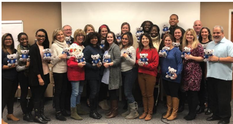
24 people were certified as Mental Health First Aid instructors through a new initiative launched in 2018